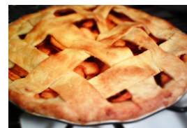
Pies are a wonderful baked good items, made especially for hungry Rectors.

Set-up will begin on Wednesday, September 28th, can you can us a hand?